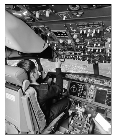
A pilot experiences a Boeing 737 MAX full flight simulator produced by Accel (Tianjin) Flight Simulation Co Ltd in Tianjin in March

Currently, China has a total of 215 units of FFS, of which 186 were produced by Canadian Aviation Electronics Inc and L3Harris Technologies from the United States. Six others were produced by domestic market players, including three by Accel.